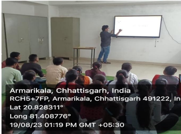
Armarikala, Chhattisgarh, India RCH5+7FP, Armarikala, Chhattisgarh 491222, India Lat 20.828311° Long 81.408776° 19/08/23 01:19 PM GMT +05:30