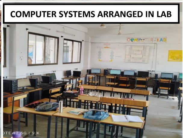
COMPUTER SYSTEMS ARRANGED IN LAB