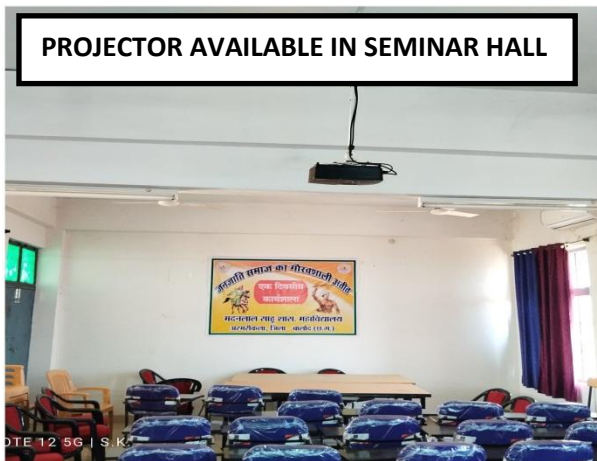
PROJECTOR AVAILABLE IN SEMINAR HALL