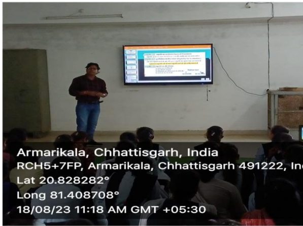
Armarikala, Chhattisgarh, India RCH5+7FP, Armarikala, Chhattisgarh 491222, India Lat 20.828282° Long 81.408708° 18/08/23 11:18 AM GMT +05:30