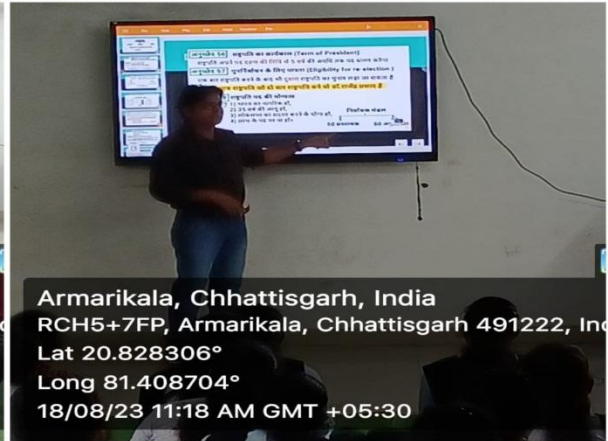
Armarikala, Chhattisgarh, India RCH5+7FP, Armarikala, Chhattisgarh 491222, India Lat 20.828306° Long 81.408704° 18/08/23 11:18 AM GMT +05:30